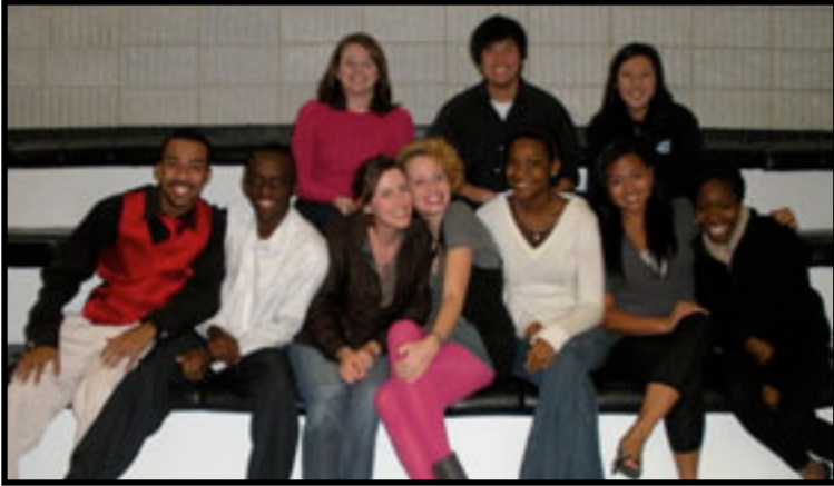
CUP team from Emory (2 not pictured) we joined 30 students and 3 staff from other schools

Between now and the end of school, please pray for a campus outreach on April 16, new leaders for next year, graduating seniors, InterVarsity chapter camp (May 9-14), and that staff and students would finish the semester in a way that honors the Lord.